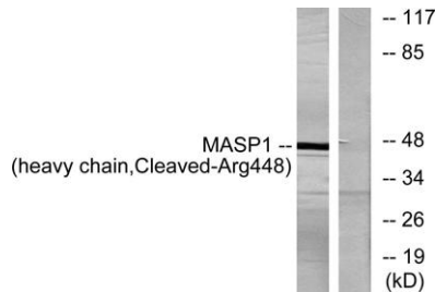
Western blot analysis of lysates from A549 cells, treated with etoposide 25uM 24h, using MASP1 (heavy chain, Cleaved-Arg448) Antibody. The lane on the right is blocked with the synthesized peptide.